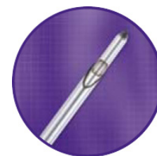
A surgical grade stainless needle and 'dual eyed' sprung obturator are securely moulded into a specially shaped hub.